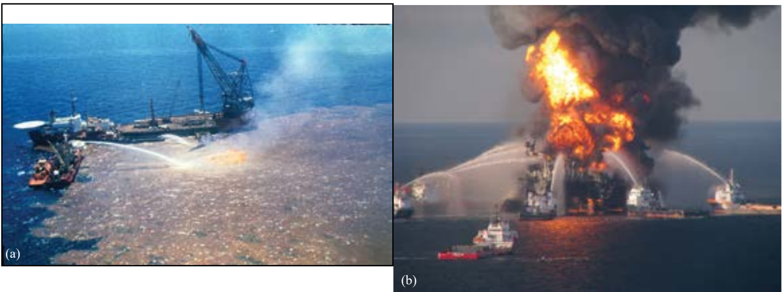
FIGURE 16B1-2 Major oil spills from the offshore oil industry are rare but dramatic events. (a) This spectacular blowout and fire at the Ixtoc oil rig in the Gulf of Mexico in 1979 resulted in a continuous release of oil that lasted for several months before the well was finally closed (b) The Deepwater Horizon rig burns before it sank in the Gulf of Mexico, April 2010.

Cleanup activities after a spill may be essential to remove as much oil as possible and speed natural recovery. However,