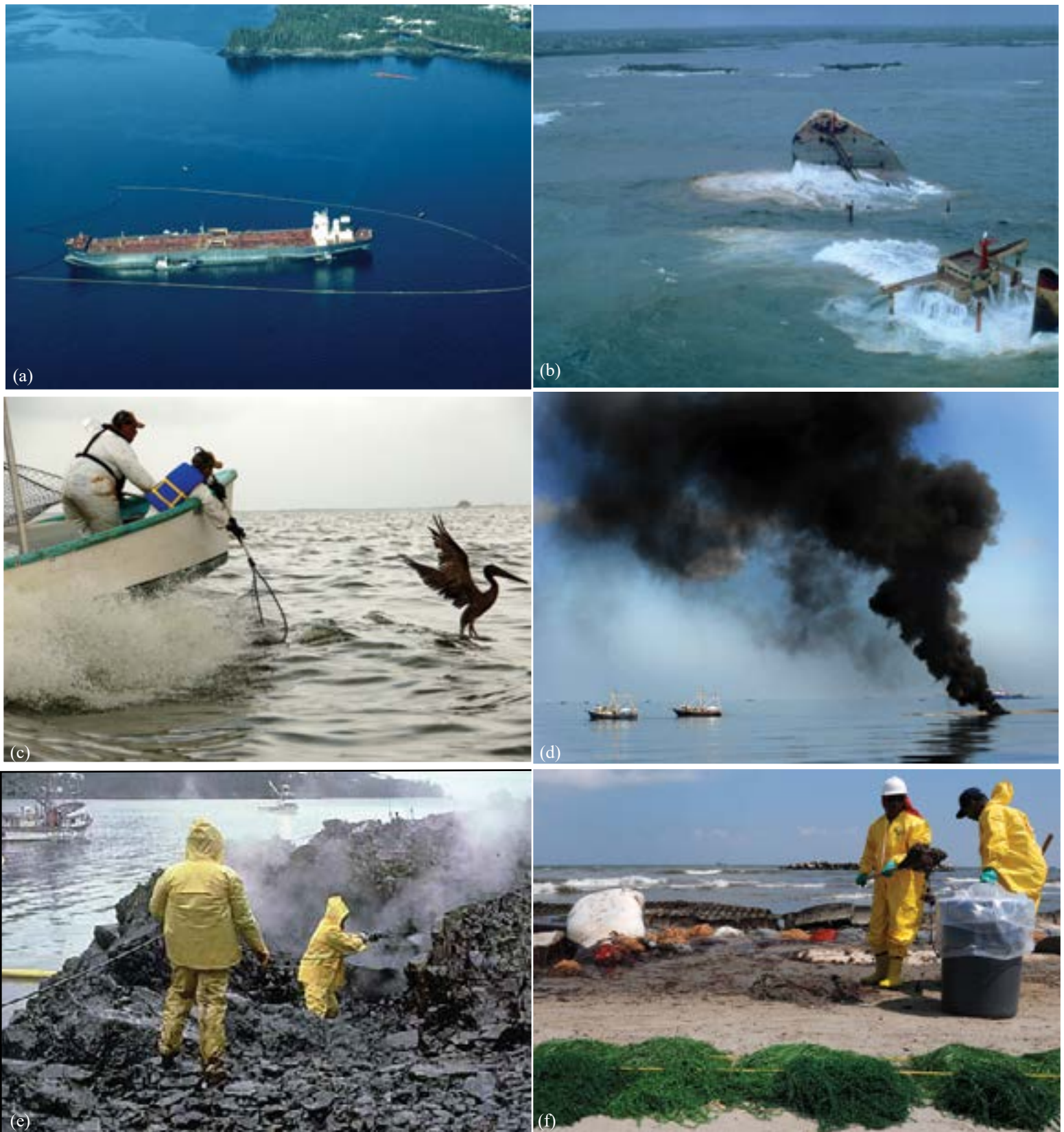
FIGURE 16B1-1 Oil spills provide spectacular images that ensure media coverage. (a) The Exxon Valdez tanker 48 h after it ran aground on Bligh Reef in Prince William Sound, Alaska, in 1989. The tanker is still leaking some oil, and it is surrounded by a boom that has been placed on the water surface in an attempt to contain this oil so that it can be collected. (b) The Amoco Cadiz , Brittany, France, 1978. (c) A rescuer tries to capture an oiled Pelican after the 2010 Deepwater Horizon spill in the Gulf of Mexico. Rarely do heavily oiled birds survive even when cleaned up. (d) A boom skimmer towed by two small boats corrals surface oil so it can be burned. Controlled burns need only low cost equipment and are one of the most effective spill clean-up techniques. (e) High-pressure water hoses are used to wash oil off a Naked Island beach in Prince William Sound one week after the Exxon Valdez oil spill. (f) Cleaning up Gulf of Mexico beaches after the Deepwater Horizon spill. Aggressive beach clean-up often causes more environmental damage than would occur if the beach were left to clear naturally.